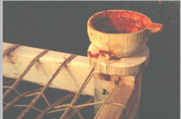
"Charpaiya" (bed), 1987, 25' x 3' x 5.' Outdoor installation (wood, fabric, rope made of jute, turmeric, vermilion)